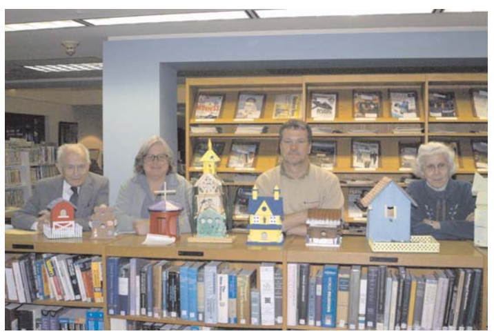
The judges stop to pose with some of the winning birdhouses. They are on display at the Northampton library.