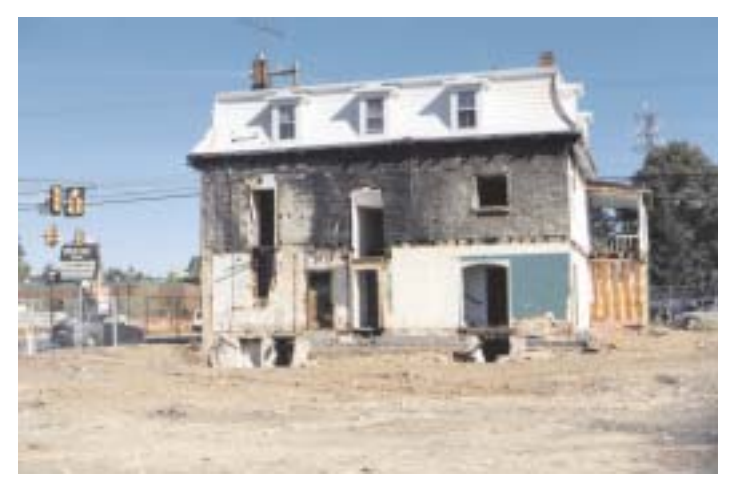
The back of the Spread Eagle Inn, stripped of it's newer additions, awaits preparation for its move about 20 feet to the right and towards you in this picture.

Thank you for your support to save the inn!