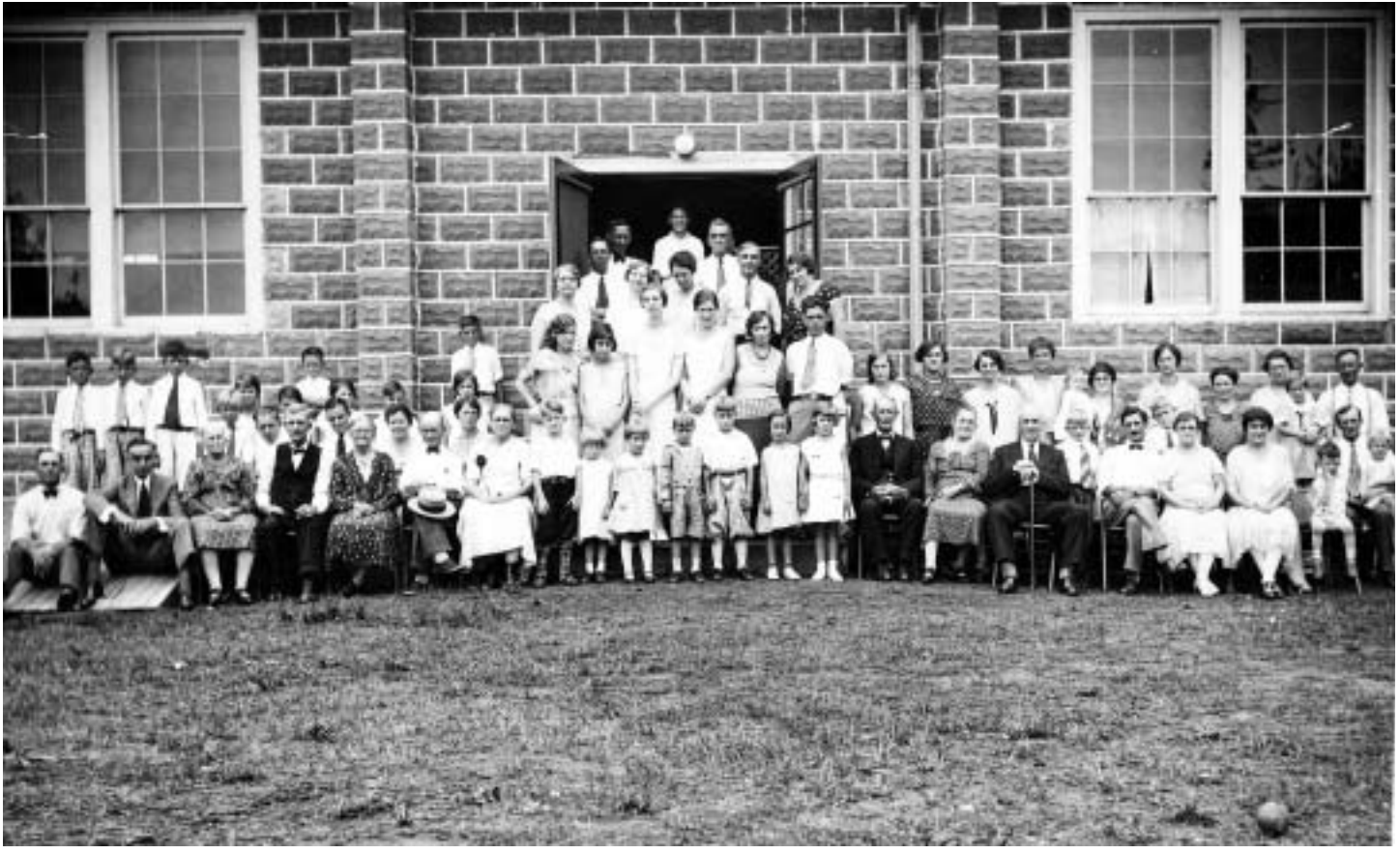
Luff reunion in 1931 on the steps of the old Richboro firehouse at 2nd Street Pike and Almshouse Road. This is now the site of the park on the corner.