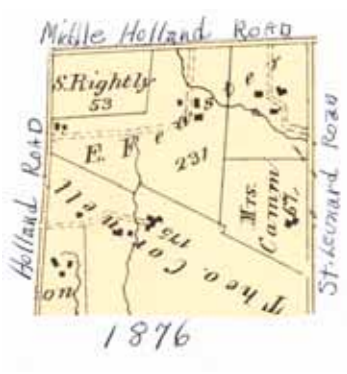
Tree believed to be 300 years old in front of the Feaster brick house. Map showing Feaster property in 1876.

Originally the properties of these four families had been in the possession of the wealthy and prosperous Feaster family, who according to the 1876 Northampton Township map owned a total of 231 acres. The majority of the Feaster land stayed in the family for seven generations.