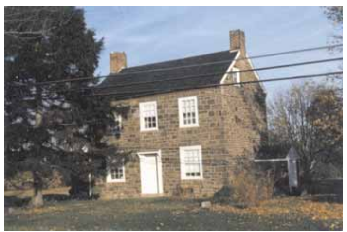
Jutta Glass home on Holland Road. This house has been added onto many times in a peculiar way and has been for sale for many years.

Originally the properties of these four families had been in the possession of the wealthy and prosperous Feaster family, who according to the 1876 Northampton Township map owned a total of 231 acres. The majority of the Feaster land stayed in the family for seven generations.