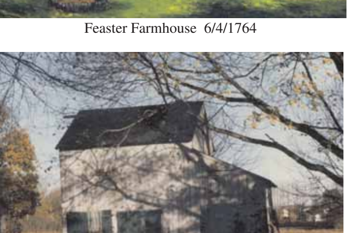
Fall picture of barn on former Jutta Glass property.