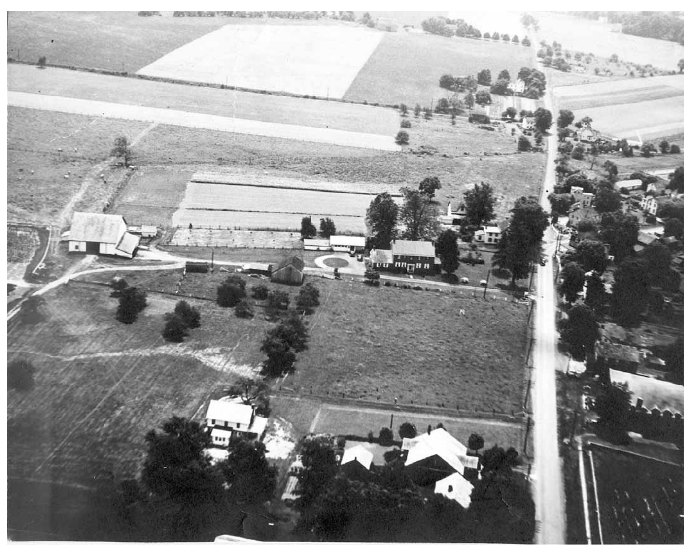
Looking South aerial view of downtown Richboro in the early 1930's. Road on the right is Second Street Pike, with cemetery in lower right. Bustleton Pike continues from the intersection at mid right to top of picture. The present day Library, Senior Center, and Junior High are now in the open fields of the old Luff farm, top left of photo.