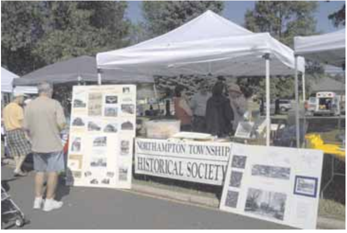
Historical Society booth at Northampton Days 2008