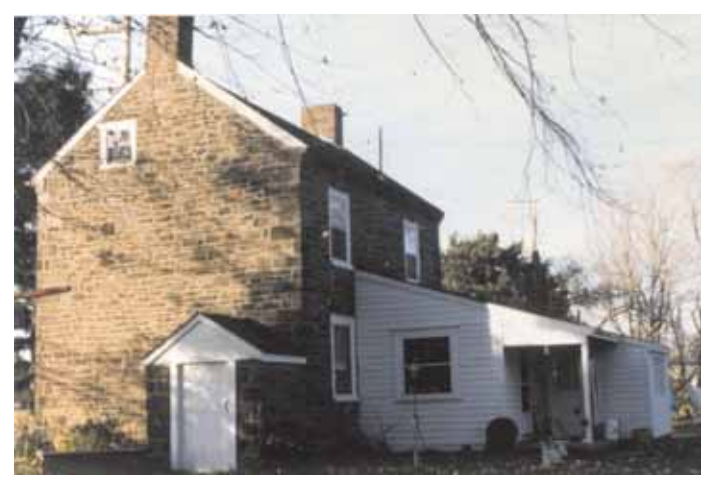
Side and rear view of former Jutta Glass property.