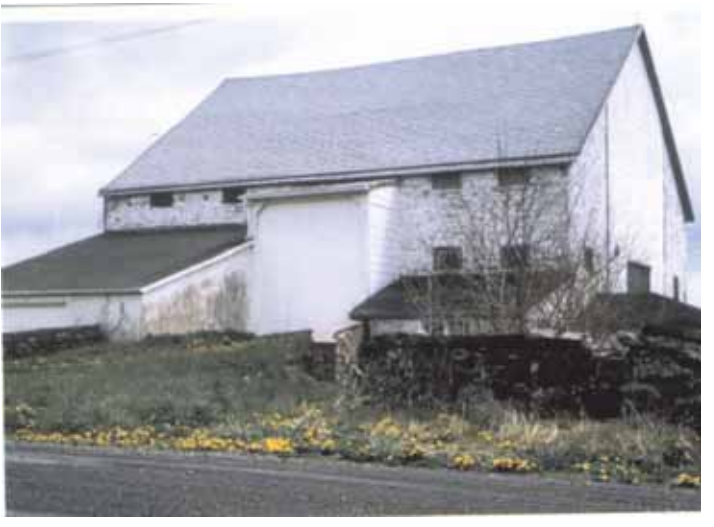
The Lempa barn built by the Feaster family