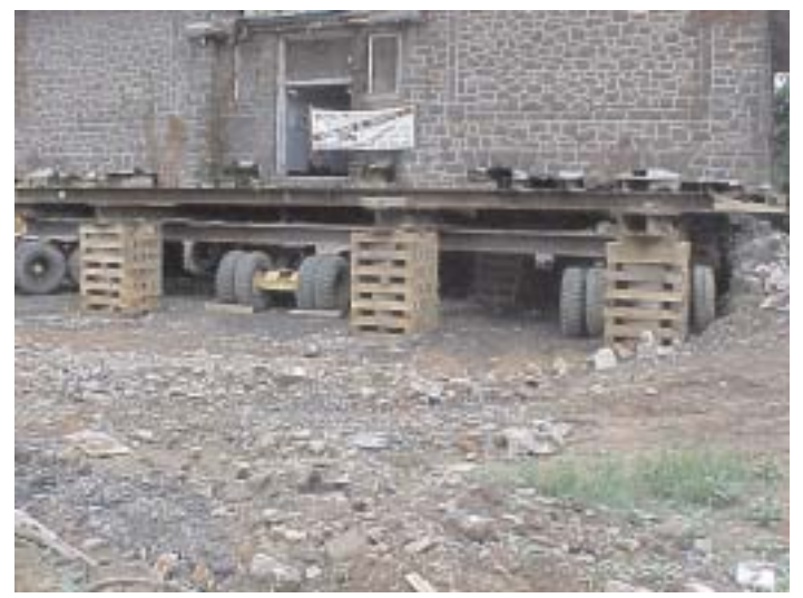
Elevated and on wheels, the Old Richboro School awaits moving day. It will be driven backwards, downhill, to its new resting place at the back of the property.

The move is part of an overall rejuvenation of downtown Richboro, the centerpiece of which is the Spread Eagle Inn. The intersection at Second Street Pike and Almshouse Road is being widened, and a new traffic light will be installed north of Almshouse Road in front of the new Commerce Bank Shopping Center.