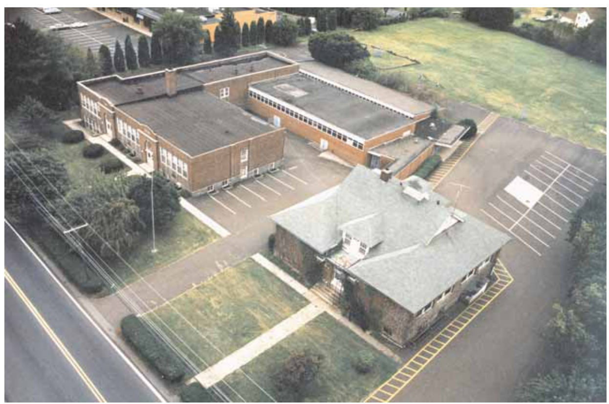
Richboro School before it was partially demolished and moved in 2003. The oldest (stone) building at the lower right was moved to the back of the property. The now demolished front brick structure to the left of the stone structure was the first addition followed by the long front to back structure at the far upper left. This is where the Home Economics and shop rooms were located. The lower level brick structure at the back was the final addition. This was attached to the stone building by a walkway.