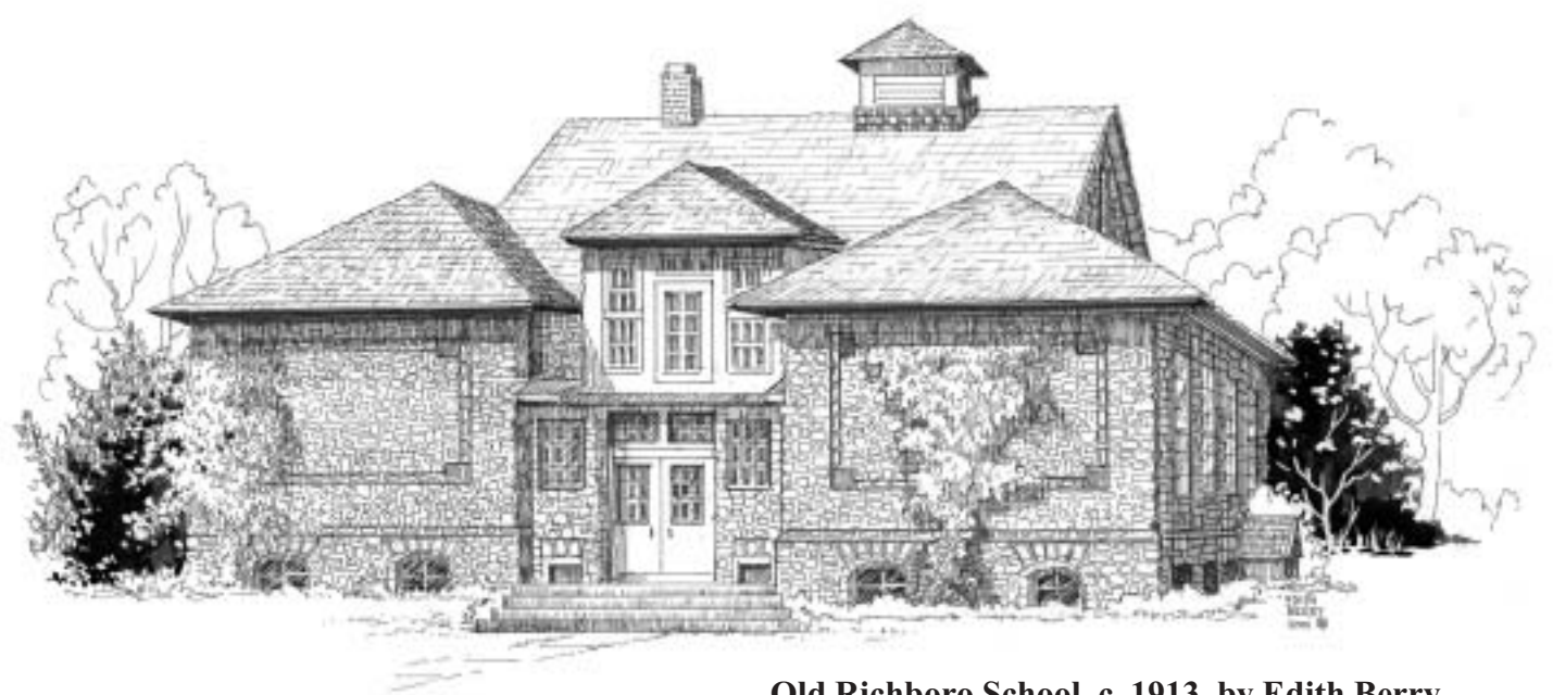
Old Richboro School, c. 1913