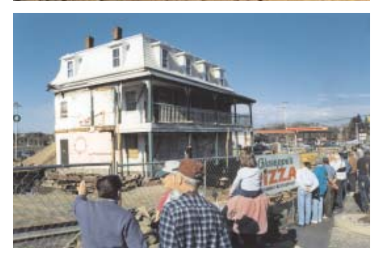
Top: Preparing for the move. The newer back and side were removed leaving the rectangular older structure. Middle: Looking northeast as it comes towards its new home. Bottom: Crowd watches from Second Street Pike.